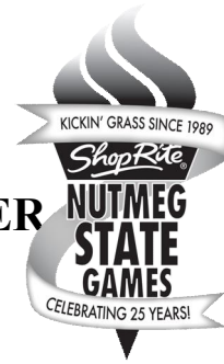
Figure skating competitors whose primary residence is not in Connecticut may compete in the Nutmeg State Games Figure Skating competition, provided that they are a member in good standing of a Connecticut based skating club or live in state that does not offer a state games program.

As figure skaters compete for the opportunity to advance to the State Games of America, they may compete in only one State Games figure skating competition. Therefore, any out-of-state figure skater competing in Connecticut's Nutmeg State Games understands and waives their right to compete in the State Games Figure Skating competition in their primary state of residence or any other State Games Figure Skating competition during the 2014 competitive season.