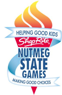
Figure skating competitors whose primary residence is not in Connecticut may compete in the ShopRite Nutmeg State Games Figure Skating competition, provided that they are a member in good standing of a Connecticut based skating club or live in state that does not offer a state games program.

As figure skaters compete for the opportunity to advance to the State Games of America, they may compete in only one State Games figure skating competition. Therefore, any out-of-state figure skater competing in Connecticut's ShopRite Nutmeg State Games understands and waives their right to compete in the State Games Figure Skating competition in their primary state of residence or any other State Games Figure Skating competition during the 2021 competitive season.